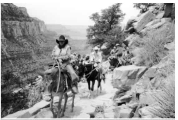
Plan well in advance if you hope to experience a mule trip down in the canyon

ues its eternal process of change. The drive back to Phoenix takes about hours. It's well worth the drive if you have the time and the weather in November per-