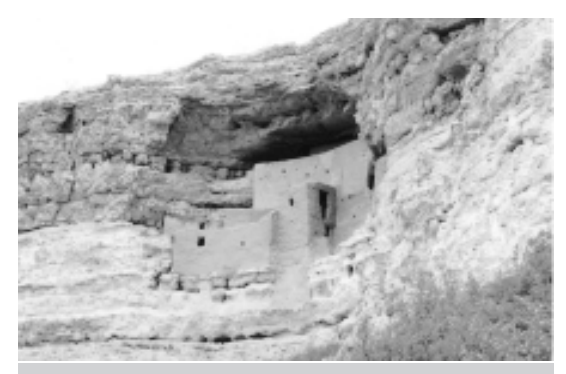
Prehistoric cave dwellings at Montezuma Castle National Monument one and a half hours north of Phoenix

hoenix is fun and a stroll through old Scottsdale is a wonderful way to spend a morning. But if you have any extra days in Phoenix, try taking a trip up to see some of the sites of northern Arizona. Take I-17 north and you will reach Montezuma Castle National Monument in about 80 minutes. There you can see the remarkable cave dwellings of prehistoric Sinagua Indians dating back to the 15th century. Stroll around the monument and visit the information center to learn about these industrious cave dwellers of the past who mysteriously disappeared from the area.