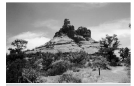
One of the magnificent red rock formations, Bell Rock outside Sedona

Next follow I-17 a little further to the Sedona exit and take Highway 179 to reach Sedona in less than an hour. This route takes you through the beautiful red rock formations and unique wilderness of the