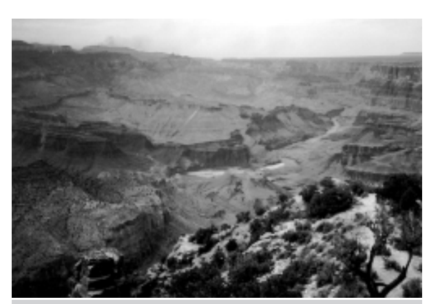
View of the Colorado River from Desert View

ues its eternal process of change. The drive back to Phoenix takes about hours. It's well worth the drive if you have the time and the weather in November per-