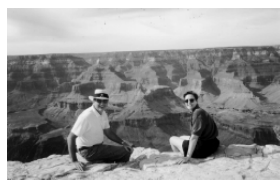
Sitting on the rim near Bright Angel Lodge

Your first glimpse of the Grand Canyon will probably be reminiscent of the first time you remember seeing the ocean as a child. Its vastness and depth is awe-inspiring and cannot be fully captured in a photograph. The colors are fantastic and change with the different light conditions of the day. Take the park shuttle out to the West Rim to watch a sunset unlike any that you have seen before. In the morning, try to catch the sunrise at Yaki Point, and if you enjoy hiking, hike down an hour or so to Cedar Ridge. The view from below is even more incredible. Make sure to take some snacks and plenty of water. The hike back up will take longer as you will probably need to rest between switchbacks. If you take the East exit from the park, be sure to stop at Desert View for a last view of the Grand Canyon. Here you can see the Colorado River flowing below and almost watch as the canyon contin-